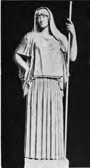
Fig. 26. Hestia.

ever, represented as a woman of stately form and calm, benign expression, dressed in the double